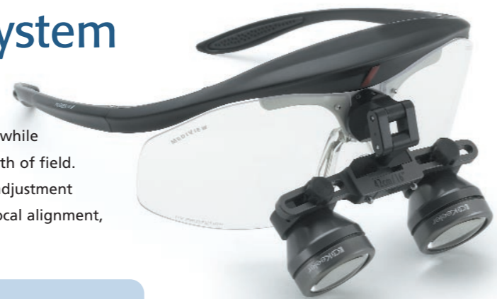
SuperVu Galilean system

The true benefit of this system is ease of use. Movement while maintaining focal clarity is made possible to superior depth of field. The lightweight aluminium bar and individual pupillary adjustment provides stability for the mounted loupes and optimal focal alignment, eliminating headache and eyestrain.