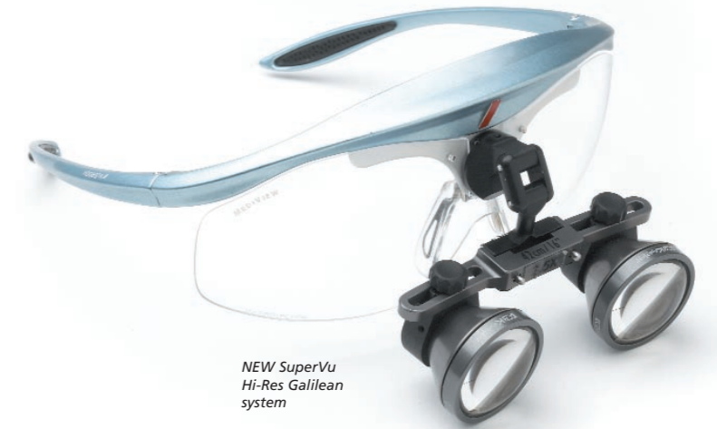
NEW SuperVu Hi-Res Galilean system

Keeler have designed a new Hi Resolution Galilean Loupe which exceeds the standards previously attained. The 5 element loupe gives a true 3x magnification with a 15% increased field of view and a perfectly flat field from edge to edge.