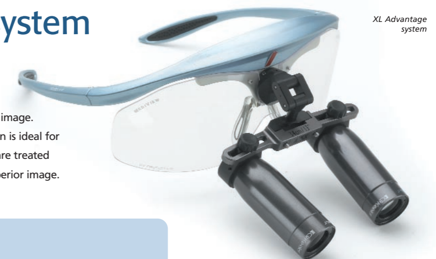
XL Advantage system

Higher magnification for advanced surgical procedures. Prismatic quality guarantees a true image. Edge to edge clarity and precise colour rendition is ideal for intricate applications. The XL's precision lenses are treated with an anti-reflective coating to produce a superior image.