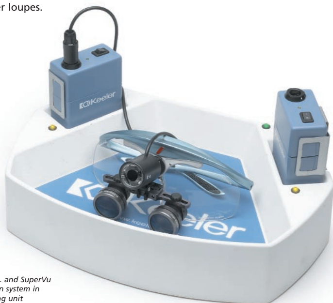
K-L.E.D. and SuperVu Galilean system in charging unit