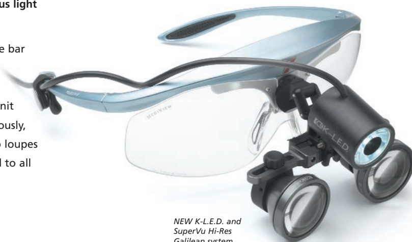
NEW K-L.E.D. and SuperVu Hi-Res Galilean system

The 3W L.E.D. is mounted coaxially on the loupe bar and is powered by a lithium battery pack giving 4 hours continuous use. The K-L.E.D. comes with two battery packs and a charging unit that can hold and charge both packs simultaneously, as well as being a convenient container to keep loupes when not in use. The K-L.E.D. can be retrofitted to all Keeler loupes.