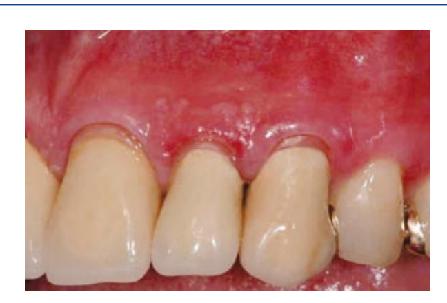
Cervical crown restorations with Amaris Gingiva