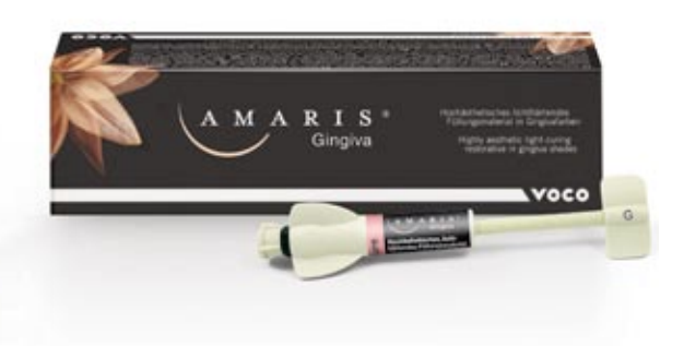
REF 1971 Amaris Gingiva refill 1 x 4 g colour "nature"

VOCO GmbH P.O. Box 767 27457 Cuxhaven Germany